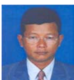
H.E. Hang Chuon Naron Member Representative of the Ministry Economy and Finance